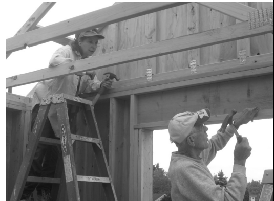
Lutheran builders on the Thrivent house.

funds from the City of Springfield HOME program for the house, we can lower the sponsorship cost by as much as $20,000. If your church or faith community would like to know more about an Apostles Build, please contact us at 741-1707.