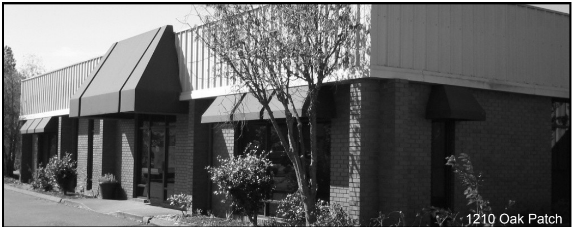
1210 Oak Patch

Watch the newsletter for updates as our construction process proceeds, or stop by and say hello to staff and volunteers in our new home. 1210 Oak Patch Road can be reached from either W. 11 th or W. 18 th . Look for the green awnings on our offices.